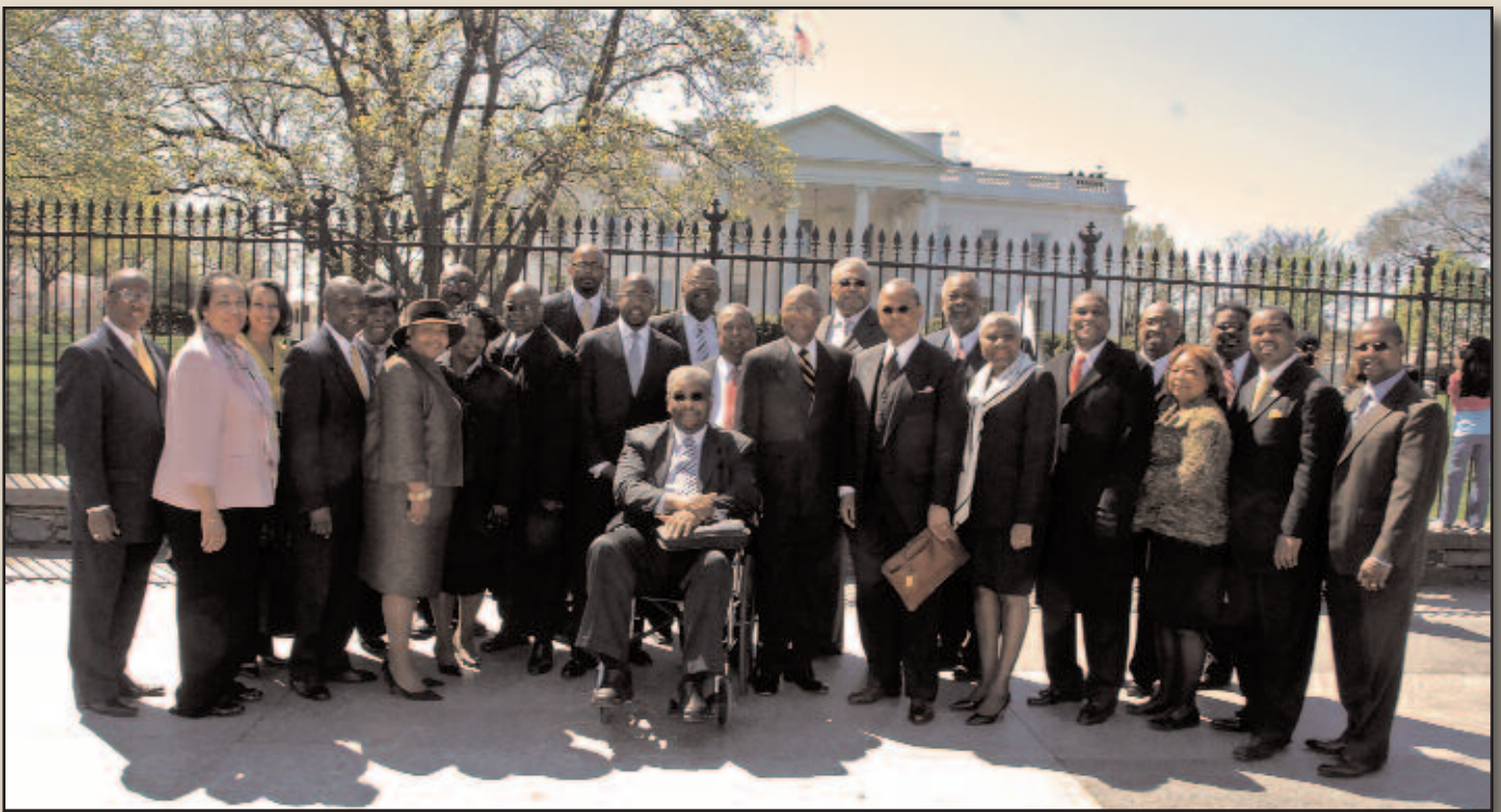
On April 16, 2009, NBLCA sponsored a summit to discuss HIV/AIDS strategies in Washington, D.C., and participating clergy posed outside of the White House before they took their message inside to the Obama administration.

munities. “The elders are the ones who have the wisdom, the ones we tend to go to help us solve our problems, or to help us celebrate, or to negotiate situations in life. The leadership model is very similar to that because it is our leaders who are sitting in that model, it’s our community stakeholders, it’s the ones who have the wisdom to help move our agenda through our communities, both good and bad. And so when we are talking with our community, our leaders, our community stakeholders, they understand the council of elders [model]. They understand why the NBLCA leadership models are headed up by clergy. Because it makes sense to them.” One is not granted eldership because of age or a title, necessarily; it’s a position that’s granted by the community.