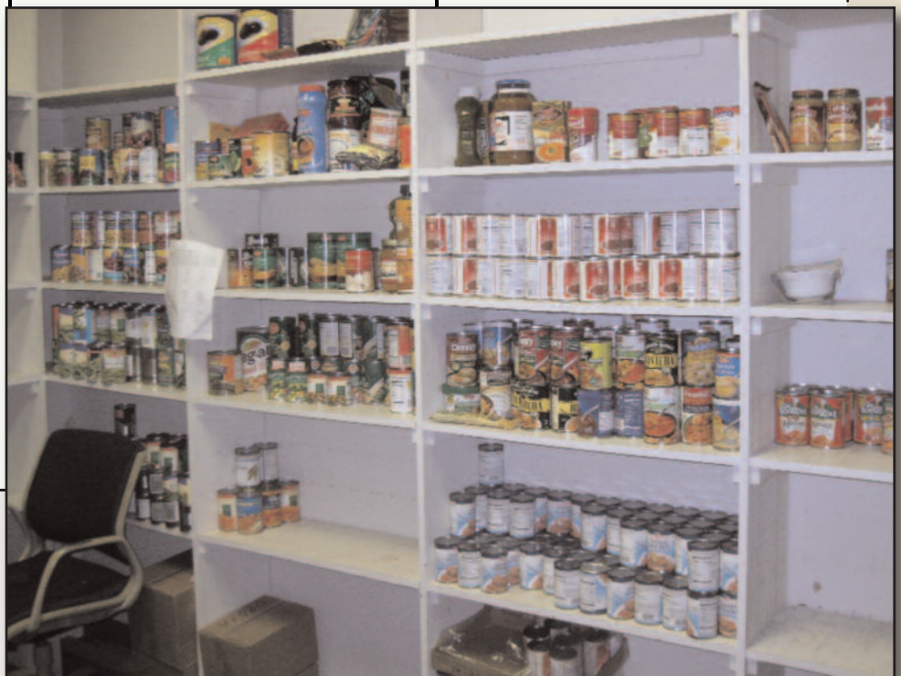
Established in 1998, BEBASHI's food pantry serves HIV-positive clients—though it never turns anyone away. During 2009, it served almost 1,200 people (due in part to tough economic times) even though it is funded to serve only 250 annually.

"I think the most important thing is respect for difference, whatever that difference is, whether it's sexual identity, race, creed, that's the most important thing—to convey that respect, that your